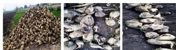
Fig. 1. Samples of sugar beet at post-harvest stage.

Samples of sugar beet roots were collected randomly from five governorates i.e. Beheira, Beni Suef, Menofia, Qalyubia, and Sharqia in Egypt during 2022/ 2023 season ( Fig. 1 ). All samples of post-harvest mature sugar beet roots were selected and examined then, divided into two groups (normal which appeared healthy and abnormal shown rotted root symptoms as a result of fungal infection). Each sample was packed in a clear polyethylene bag with all necessary related information, transferred to the equipped lab, and kept at -4^{\circ}\text{C} for further study. Morphological growth parameters and sugar content were determined between normal and abnormal roots.